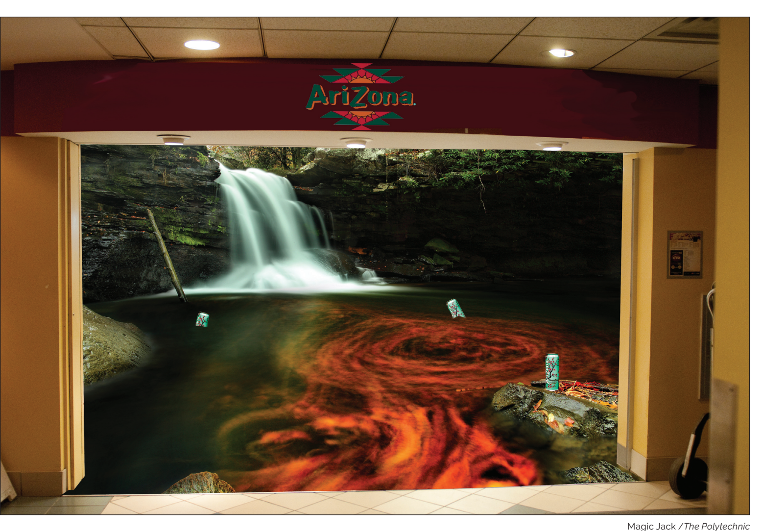
AN ARTIST'S RENDITION OF THE LONG-AWAITED NEW ARIZONA FACTORY WAS released alongside the state-of-the-art proposal.

Many new RPI-branded programs are planned to accompany