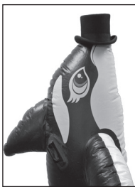
The Whale Grand Marshal gm@rpi.edu

Wooooooooooooooooooooo Wooo ooooooooooooooooooooo oooooooooooooooooooo oooooooooooooo oooWooooooooooooo oooooooooooooooooo ooooooooooooOOOooowOOoooooooooooo ooooooooooooOOOOOooooooooOOO OOO WOOOOOOOOOOOOOOOO